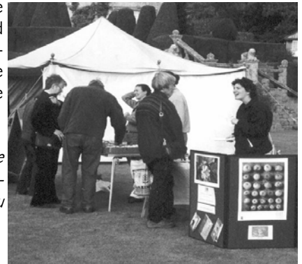
Apple and orchard information available for the first time last year at the NTS Hill of Tarvit Plant Sale, Fife

Please mention "The Central Core Newsletter" when you contact anyone.